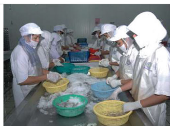
Fisheries & Meat Processing