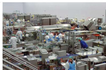
Frozen Food & Ready to Eat Food Packaging