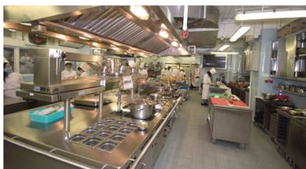
Kitchens of Hotels Canteens, & Restaurants

Tank Capacity : 1.5 Liter. Weight : 8 Kg.